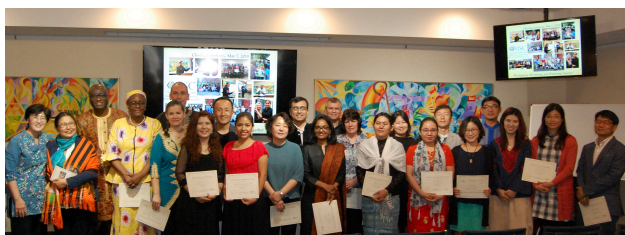
2018-2019 OMSC global partners from China, Columbia, India, Myanmar, Nigeria, Paraguay, Peru, and S. Korea

Each year, we welcome a group of global partners from the majority world to campus. They include local and cross-cultural church leaders, scholars, and educational administrators from every Christian tradition, enlarging our understanding and vision of the world church's participation in God's mission in Jesus Christ through the Holy Spirit. During residency, our global partners conduct independent research, attend seminars, and actively participate in the life of the seminary community to promote their own personal, intellectual, and spiritual growth.